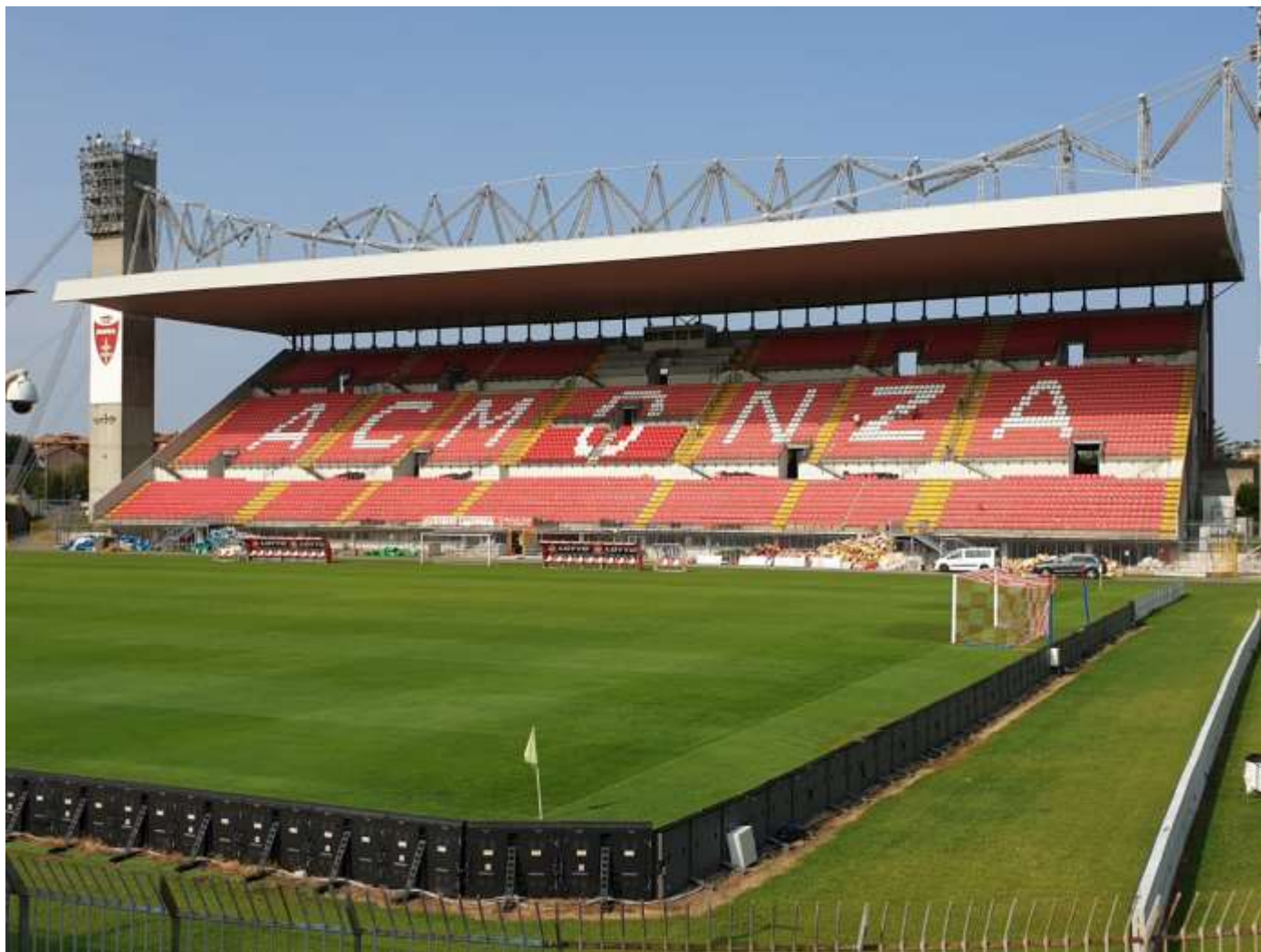
AC MONZA CALCIO - STADIUM BRIANTEO