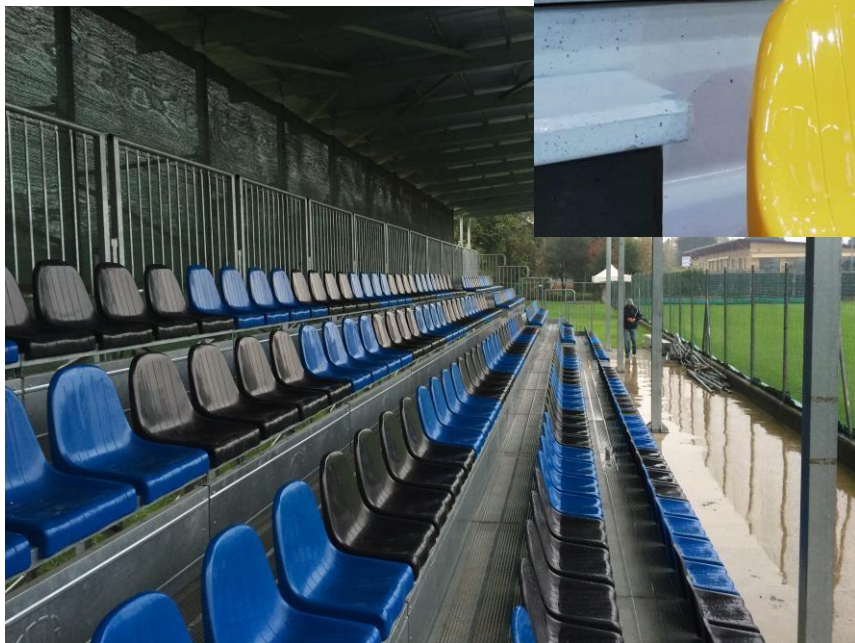
ATALANTA BERGAMASCA CALCIO TRAINING CENTRE ZINGONIA