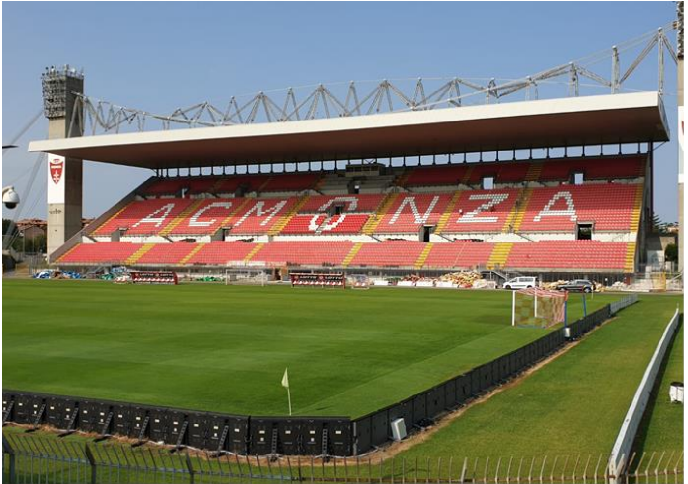
AC MONZA CALCIO - BRIANTEO STADIUM