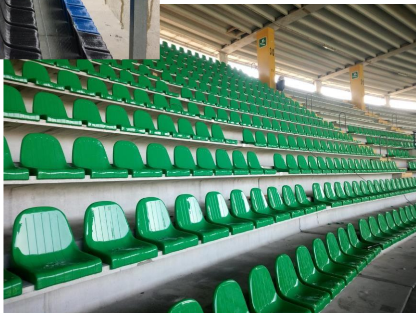
A.C. CHIEVOVERONA STADIUM M. BENTEGODI